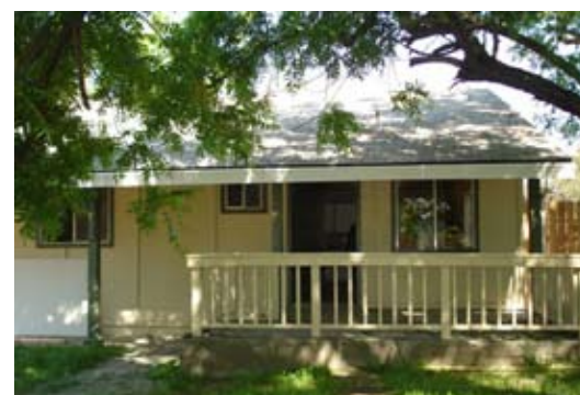
5935 Garden Ave., Olivehurst. Totally remodeled duplex.. Fresh paint, tile floors, new windows, new blinds, gas range fenced yard. Home is 950 SF, 2 BD, 1 BA.