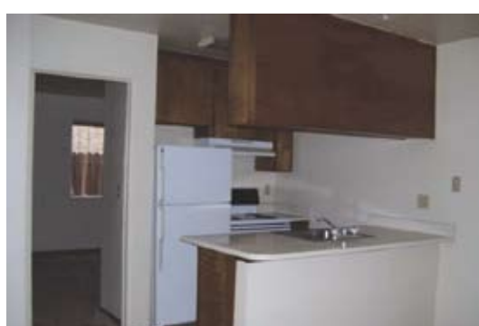
1101/1107 Ramirez St., Msvl. GREAT MOVE IN SPECIAL $99.00 1st Month Rent + Deposit. Section 8 is Welcome!!! Water,Sewer and Garbage Paid By Owner,Refrigerator. Each unit is 1 BD, 1 BA.