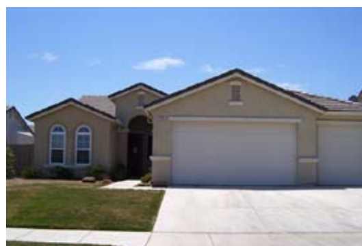
716 Shanghai Bend, Yuba City Newer home in great neighborhood. Living room, dining rm, central heat and air, 2 car garage. Home is 2000 SF, 4 BD, 2 BA.