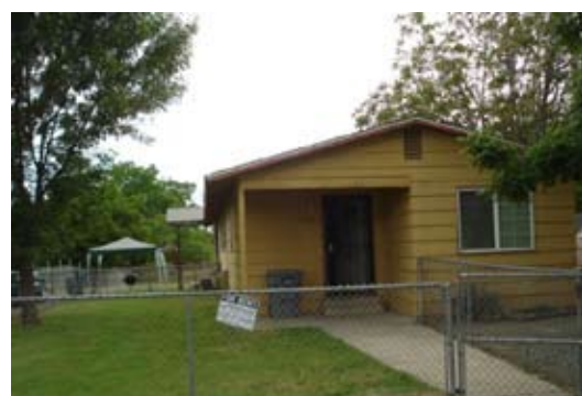
5804 Riverside, Olivehurst Well maintained home with 800 SF, 3 BD, 1 BA. Living rm, dining room. Fenced yard.