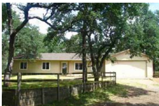
Beautiful Loma Rica Property on 5.51 acres. Property has 6 fenced and crossed pastures with pressurized irrigation. Nice home with 3 BD, 2 BA, 1500 SF. Only 10 minutes from Collins Lake. $279,900 (LR 11716)