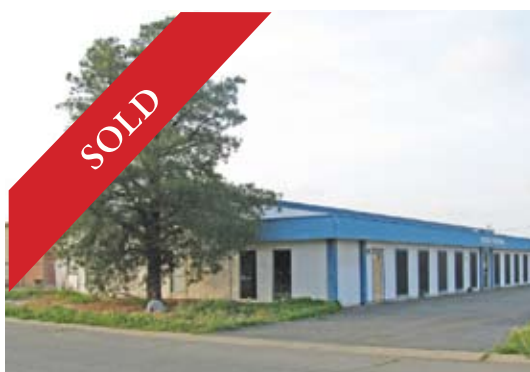
New REO listing. 850 N. George Washington Blvd, Yuba City. Industrial/showroom. Merchandise display area with 2 separate offices. Warehouse area 4,100 +/- sq. ft. Additional separate 950 +/- sq. ft office. Enclosed yard. Greg Quilty.