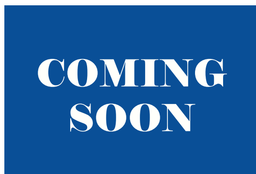
949 Tiburon Way, Plumas Lake, NEWER HOUSE CLOSE TO BEALE AIR FORCE BASE! Beautiful House with Living Room w/ fireplace,Dining Room,Great Kitchen with Granite Counters tops.