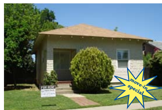
663 ELM ST, YUBA CITY. NICE HOUSE!! CLOSE TO YUBA CITY HIGH SCHOOL. Great Property w/ 2 BD, 1 BA, 1100 SF. Hardwood Floors,Mini Blinds,Ceiling Fans,Range,Refrigerator,Laundry Room.