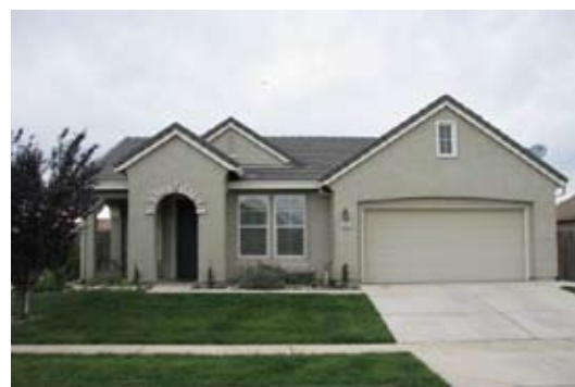
Beautiful home in Plumas Lake. 4 BD, 2 BA, 1841 SF. Open kitchen, office or play room for kids. Nicely decorated. Large backyard with covered patio. Near park. $178,900 (BB 2092).