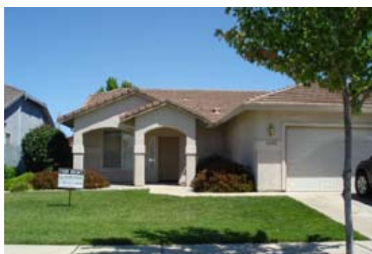
1493 Countryside, Yuba City Great neighborhood. Living room w/fireplace, family room, Eat-in-Kitchen, range, dishwasher, in-door laundry room. 3 BD, 2 BA.

Visit www.YubaSutterRental.com to see all our rentals online!