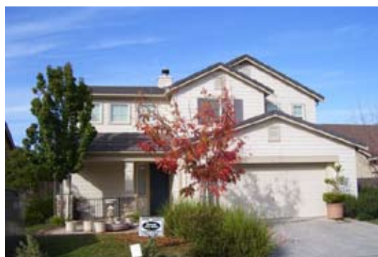
261 Shanghai Bend, Yuba City Newer two story home. Home has 2000 SF, 3 BD, 3 BA. Living rm, dining rm, patio with great backyard. 2 car garage.