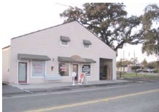
Come and check out this unique property. This property includes a secure yard; covered R.V. parking; retail space; warehouse/shop space and a 2 bedroom 1 bath apartment/house. Owner financing avail. $319,900 (A 1972)