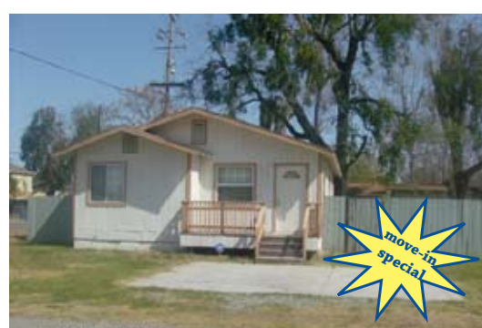
5939 Cohn, Olivehurst. Newer home! Tile floor in living rm, kitchen, and bathrooms. 3 bedrooms, 1 bath with. Large fenced backyard.