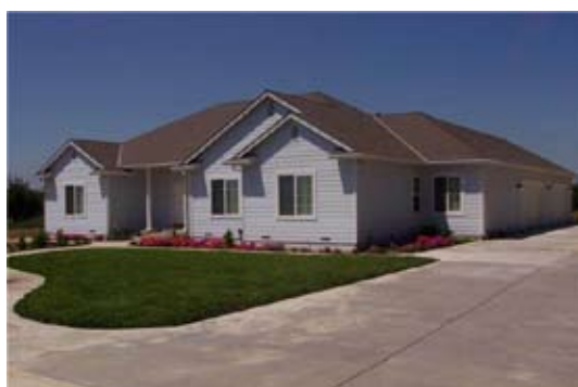
Newer custom built home on private 2 acres. Beautiful cherry wood floors, separate master with walk-in granite shower. Formal dining room & den/office. 9' ceilings. Two large 2 car garages. $429,000 (T 11178)