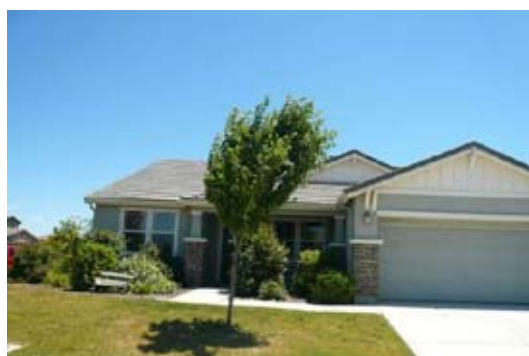
Nice home in Live Oak. Very clean and well maintained home with 3 BD, 2 BA, 1752 SF. Bedrooms are large, great room floor plan. Backyard with large concrete patio. Asking $155,900 (P 3289)