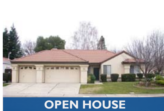
OPEN HOUSE OPEN 11 AM TO 2 PM 1725 Meadowlark Way, Yuba City. Home has 4 BD, 2 BA, two living rooms, bedrooms are roomy. N on Stabler, R on Jamie, R Meadowlark. $299,900.