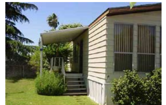
Nice double wide Manufactured home in family park. Home has 2 BD, 2 BA, extra large site, 2 storage buildings and mature trees including a cherry tree. Asking $29,900 (L 2160)