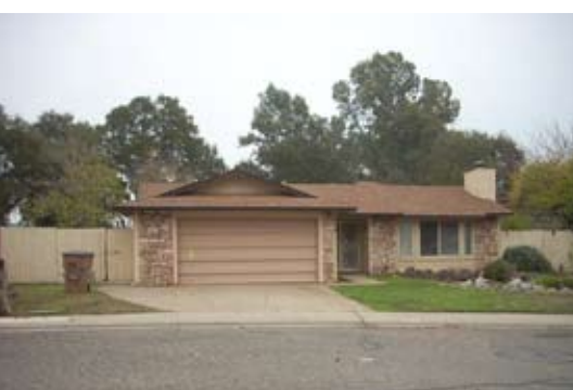
214 1st Street, Lincoln SPACIOUS HOME W/LARGE FENCED BACKYARD!! Large Lot! This House has a Living Room W/Fireplace . 2 Car Garage, RV Parking. Close to Schools and Shopping.