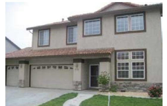
Plenty of Room in this 6 BD, 3 BA home in Yuba City. One bedroom and bath downstairs, office and in-door laundry room. 3 car garage. Beautiful tile and laminate flooring throughout home. $389,000 (V 770).