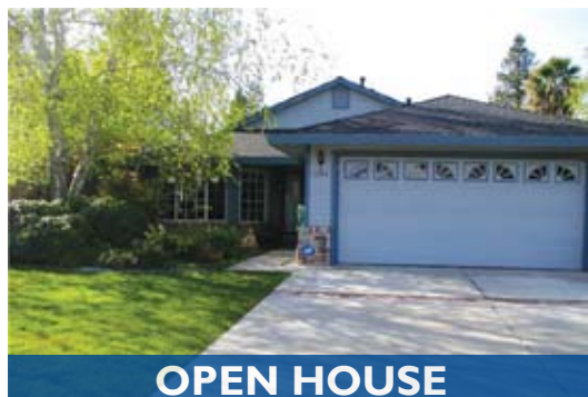
OPEN HOUSE OPEN 11 AM TO 1 PM 3244 Lyle Ct., Yuba City. This lovely 3 BD, 2 BA, 1877 SF home. Hwy. 20 to Royo Ranchero, R on LaMantia, L on Cynda. $265,000.