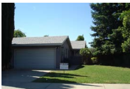
1172 Forestwood, Yuba City Nice duplex. Living room w/fireplace. Dining area, fenced yard. 950 SF, 2 BD, 2 BA.